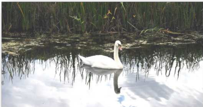
Swan on the Grantham canal

The annual pub quiz will be held on Saturday, 17th January 2026 at 7.00 pm in Eastwell Village Hall.